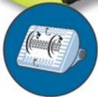
Extra Active Brushing