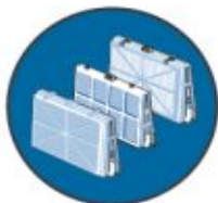
Filtration: option of 3 types