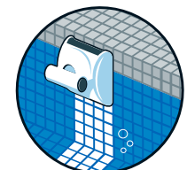
Water line Cleaning