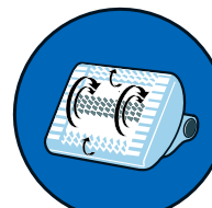
Extra Active Brushing